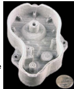
Figure 3. The Desktop Factory's low price (and future lower price) has the potential of bringing RP technology into the home.

A new company on the block is trying to position itself to mainstream RP. It is Desktop Factory ($4,995, figure 3 ). Its machine is one of the smallest I have seen (a cube of approximately two feet). It won't make the largest of parts in one piece, but it can create models as large as 5 cubic inches. Its resolution tops out at .010-inch layers, so it's also not going to make extremely small parts. What's it good for, then? As the technology improves, so will the resolution and the price. Desktop Factory says that when it gets fully up and running in production, its price might fall to roughly $1,000. At that point, I know I'm going to buy one. And why would anyone want one of these things for their home? Why, to print off whatever your little heart desires, of course! The Internet hosts many free or low-cost 3D model libraries. Imagine downloading a model and printing out a model kit or maybe that pesky battery door that you lost off the TV remote. What a blast this technology would be!