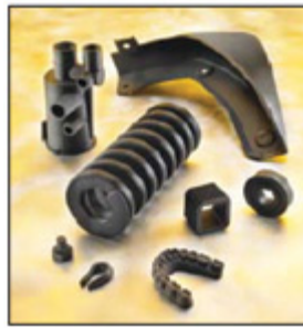
Figure 1. By tracing each layer of your computer model, you can create marvelous physical models that you can hold in your hand.

Z Corp. (approximately $25,000) entered the low-cost RP market a few years back and has done quite well. It has a unique claim to fame that anyone can appreciate: Its machines can print in multiple colors on the same RP model ( figure 2 ). This capability lets you model in graphics or show such things as overmolding. A lot of companies use the technology to quickly visualize device designs without having to paint the models. They build their models with a powder held together with a binder agent and an infiltrant, and that's primarily why it can handle the color. The print heads are very much like those in your ink-jet printer.