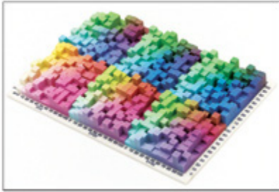
Figure 2. Z Corp. has the unique capability of modeling in whatever combination of colors you want.

most RP technologies. The model also will have a fairly porous texture because of the fusing of the filaments, but you can seal it with a solvent.